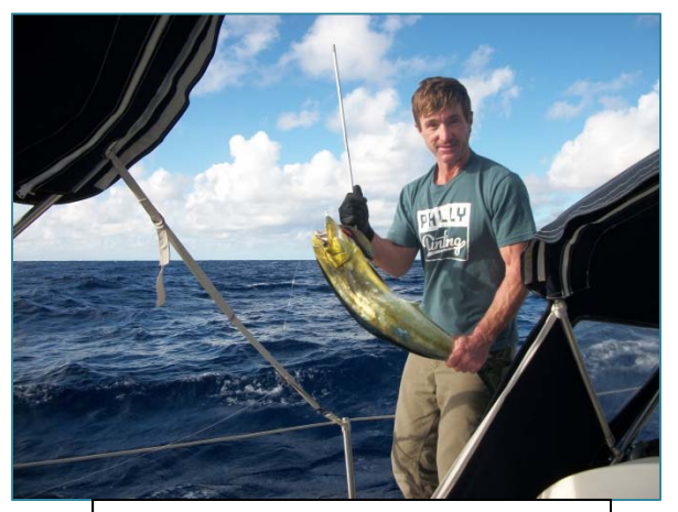
Catching Dinner While Underway

Learn skills required to safely sail offshore for an extended period while accompanying us as we move our teaching vessel, Gallivant to the Caribbean in the fall and back in the spring. 9-13 day, live aboard classes, which provide students with an understanding of yacht preparation for ocean sailing, course planning, working a watch schedule, use of celestial navigation, weather analysis, storm avoidance, heavy weather sailing techniques including use of drogue and storm jib, use of radar, techniques for crossing the Gulf Stream, and other elements involved in ocean passage making. All classes taught by an ASA certified and USCG licensed captain.