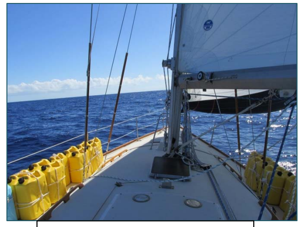
Yacht Preparation and Departure